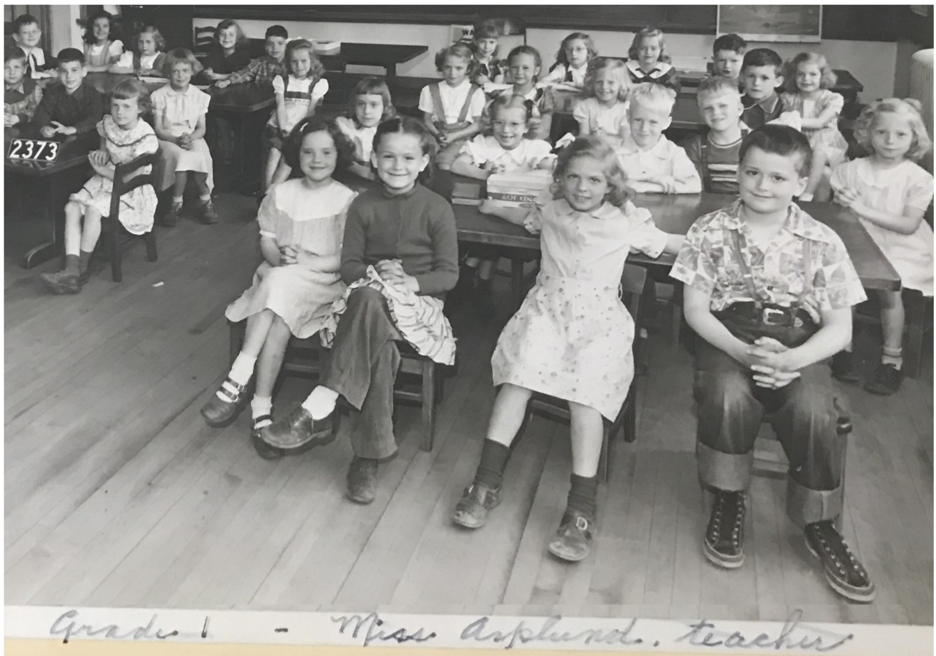
Burwell School students - First grade 1949

Please join us at the City Hall on May 8th at 7PM. Beverage and cookies will be provided as usual.