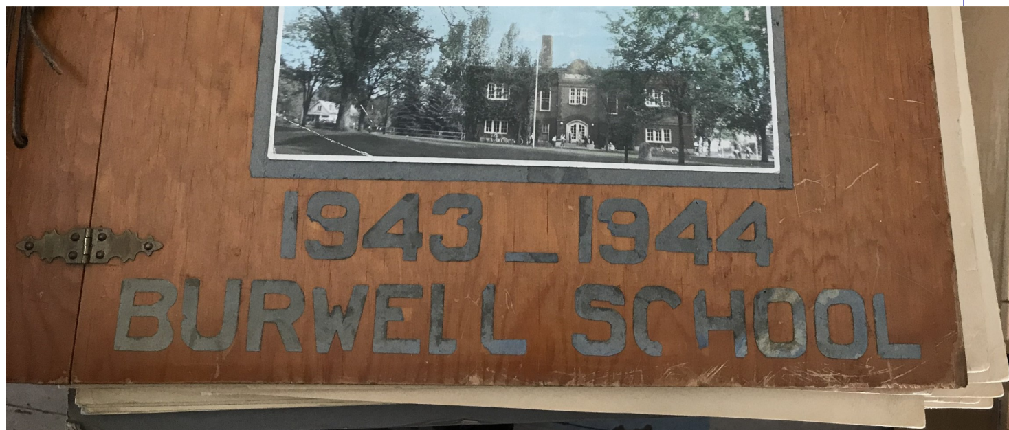
1943 wood bound Burwell School scrapbook

One of many handwritten descriptions and lists of people participating in historic wartime activities at the Burwell School (which will be shown at the Spring Presentation.)